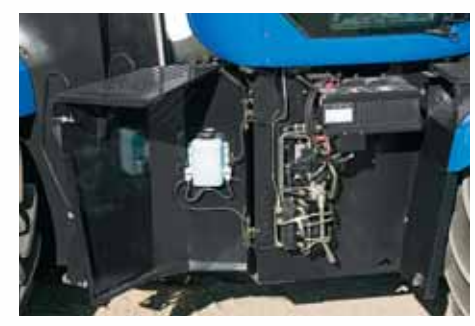
Reach batteries, washer fluid and axle lube filter through this handy right-hand service door. Steps on the door let you use a service-access window to reach the electrical components in the cab and easily route monitor cables.

coolant level. And, a clean-out trap door located under the radiator, allows you to clean the radiator and cooling system without hassles.